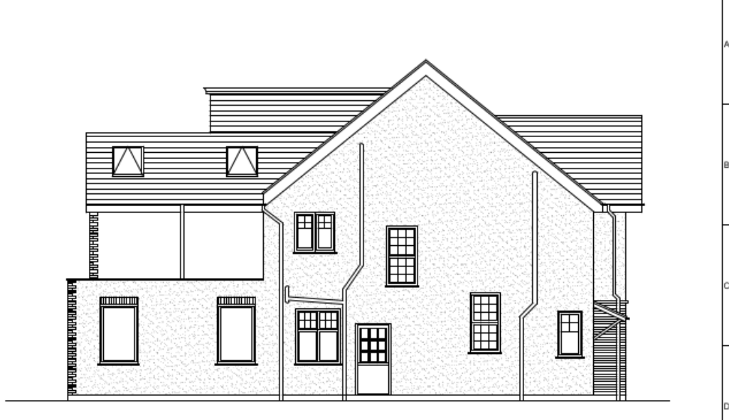
2 SIDE ELEVATION - PROPOSED Scale: 1:100