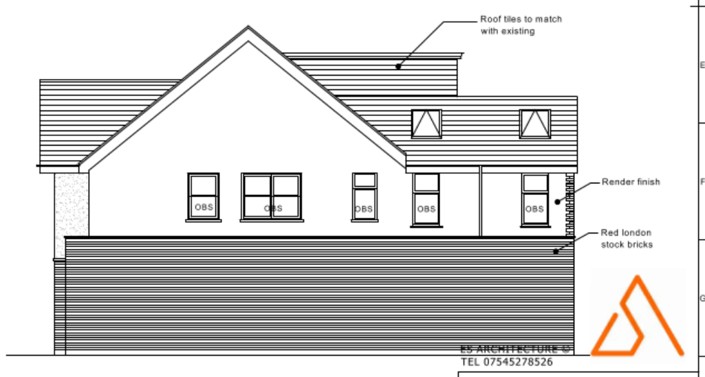
4 SIDE ELEVATION - PROPOSED Scale: 1:100