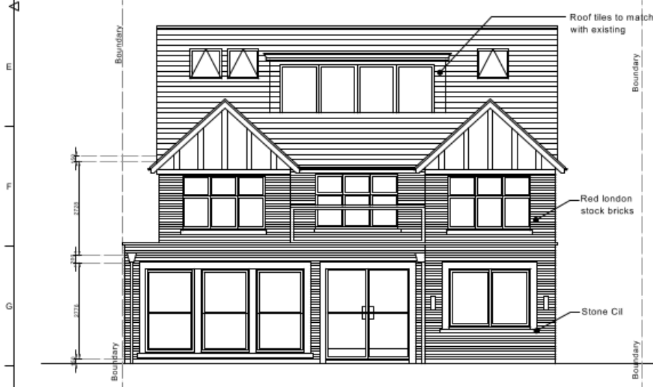
3 REAR ELEVATION - PROPOSED Scale: 1:100