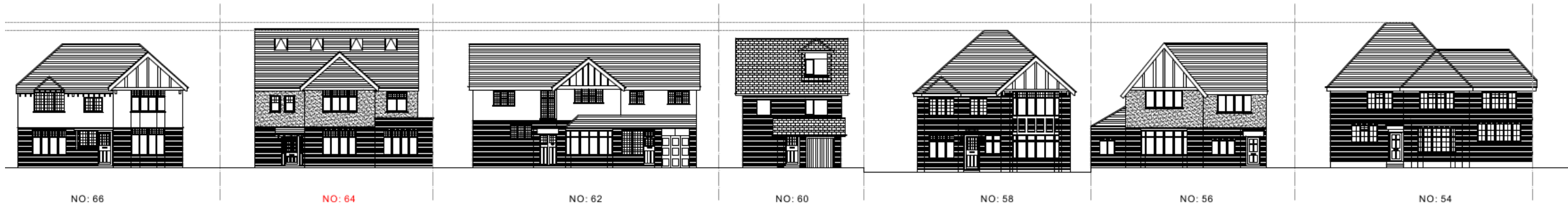
1 STREET ELEVATION - PROPOSED Scale: 1:200