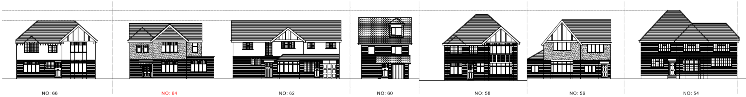
1 STREET ELEVATION - EXISTING Scale: 1:200