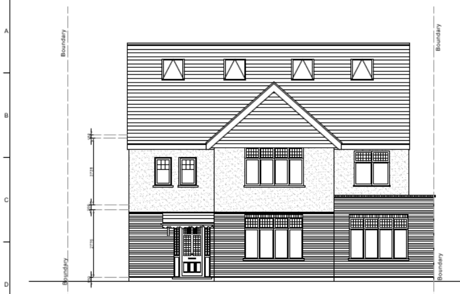
1 FRONT ELEVATION - PROPOSED Scale: 1:100